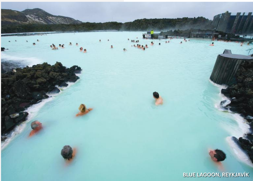
BLUE LAGOON, REYKJAVIK

Enjoy a free day at leisure, shopping, sightseeing and exploring the city. You could also join an optional tour that departs from Reykjavik, to the Langjökull glacier, Iceland's second largest glacier. Board a monster truck for a once in a lifetime adventure deep inside one of the world's largest man made ice caverns. The caverns are composed of an extensive system of tunnels and chambers that stretch close to 300 metres into the