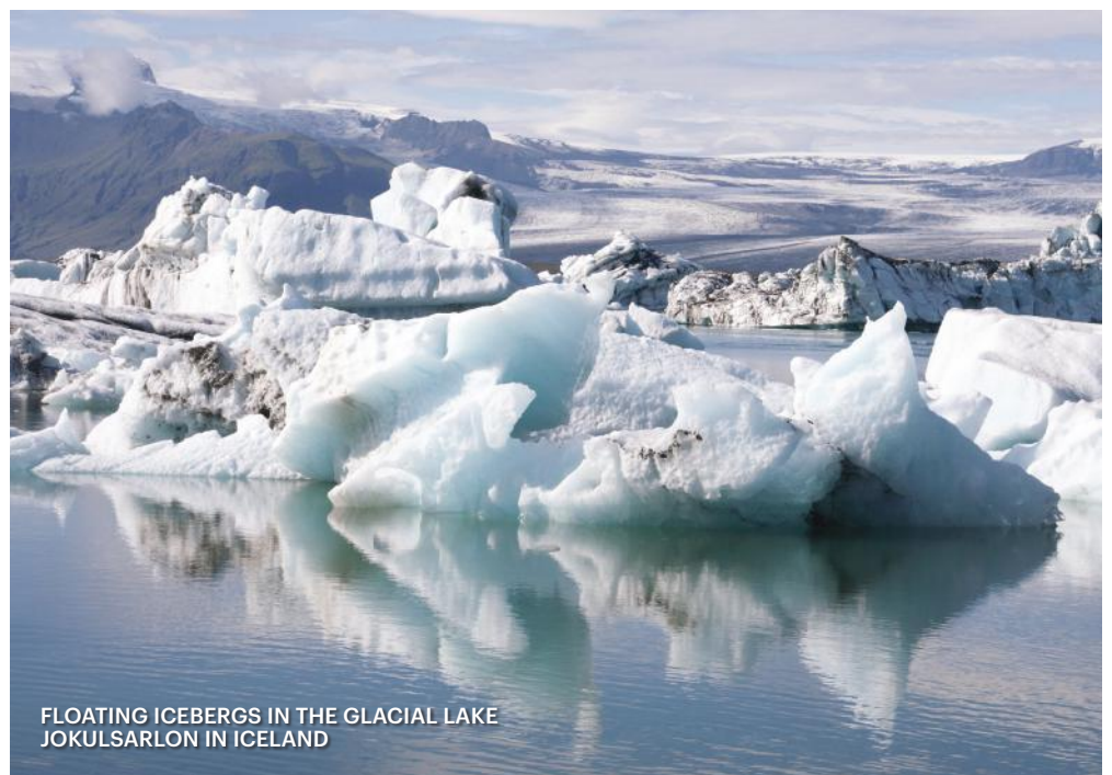
FLOATING ICEBERGS IN THE GLACIAL LAKE JOKULSARLON IN ICELAND